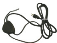
2590/12 IN LINE SWITCH CABLE ASSEMBLY 120V