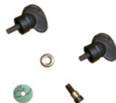
2590/150 STIRRUP LOCKOFF KNOBS AND HARDWARE KIT