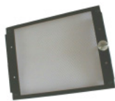
2595/179 WIRE GUARD ASSEMBLY