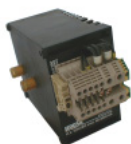
3000/13 IGNITER TYPE AD 6055/Q IREM