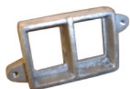
5360/21 PUSH BUTTONS SUPPORT