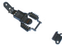
4511/2 DOOR LOCK ASSEMBLY