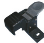
5390/105 HINGED BRACKET ASSEMBLY