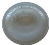
5390/103 LENS DIA. 450 MM