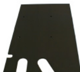
5390/215 IGNITER INSULATING SHIELD