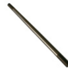
5390/107 HINGE PIN