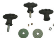
5485/150 BLACK FOCUS PLUS STIRRUP LOCKOFF KNOBS AND HARDWARE KIT