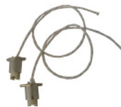
209/1 LAMP SOCKETS PACK OF 2 PIECES