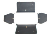
2595/3 BARN DOOR LEAFS COMPLETE 2+2